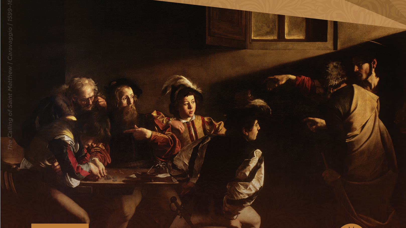
The Calling of Saint Matthew | Caravaggio | 1599-1600